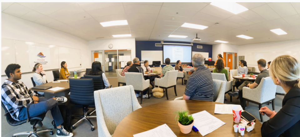
PHARR Centre Launch

The event also included planning for the upcoming C2 workshop on Rural Aging and Dementia.